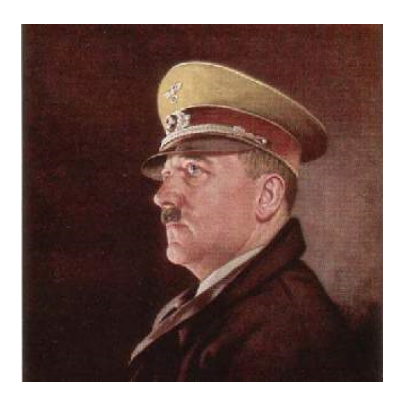
WW 2 was started over the Danzig corridor which was part of Germany until the Versailles treaty gave