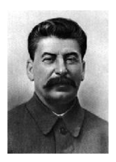
The 5 ' 6" Jewish Stalin and Bolsheviks now have their war and British, French, American, Canadian, etc blood will be spilt all over Europe to decimate Germany and open the world to the Jewish swindle called communism.