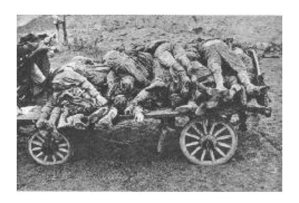
The Polish Bolsheviks kill 58,000 German Nationals in the Danzig corridor

In the months leading up to the German invasion the Polish Army and independent Bolshevik units had been slaughtering German nationals in the Danzig corridor. Mass killings of thousands of civilian ethnic Germans (Volksdeutsche) by both civilian and Russian NDVK Jews, who were confident that Poland would quickly defeat Germany. Many apparently expected to take possession of German farms and businesses. An estimated 58,000 German civilians lost their lives in the massacres carried out prior to the 1939 invasion.