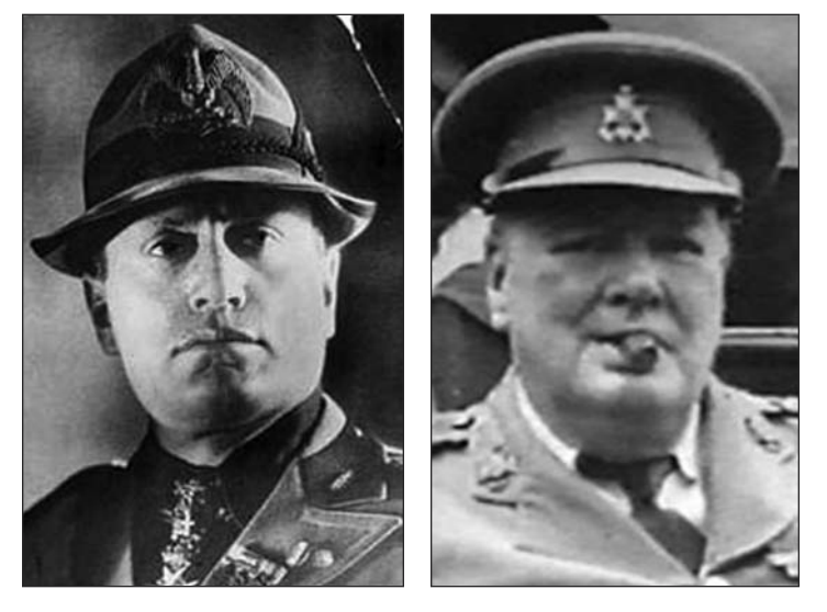
In 1952 Luigi Carissimi-Priori was offered 100,000 pounds by British sources for photocopies of correspondence between Mussolini (left) and Churchill (right).

Before year's end, Churchill proposed in another letter to