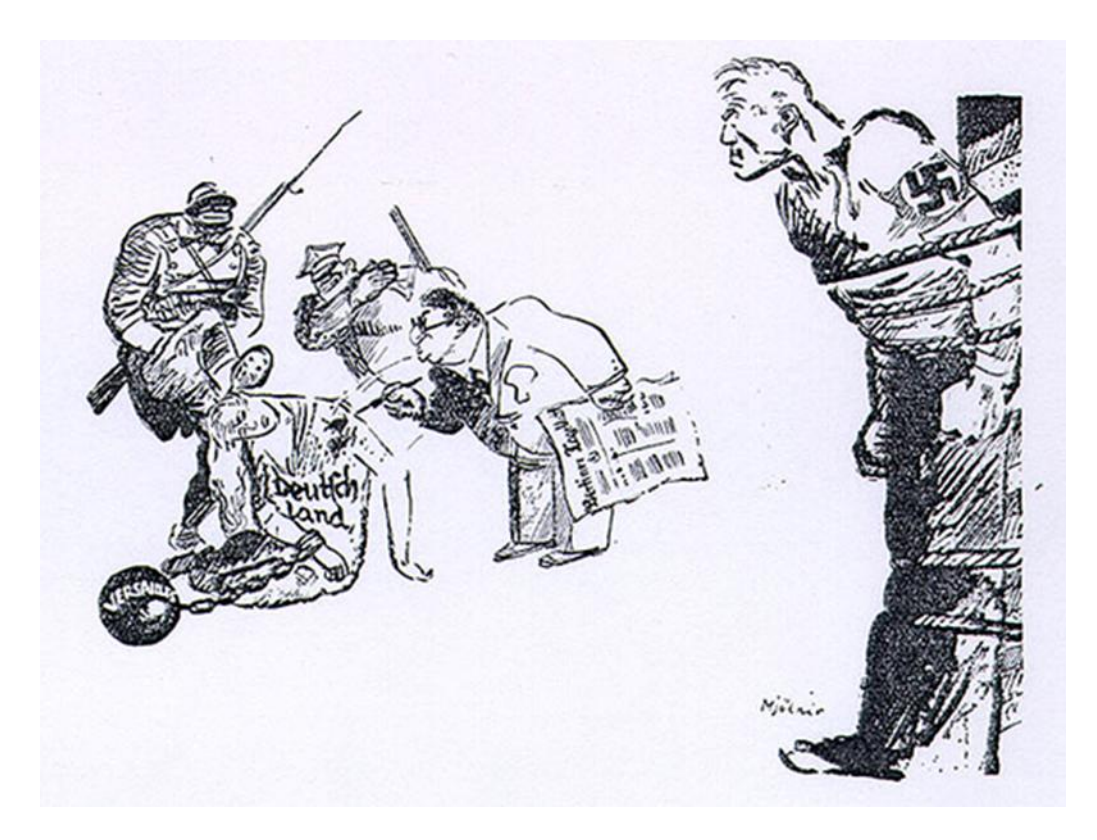
A tied-up Nazi watches while a Jew holding the Jewish-controlled newspaper Berliner Tageblatt mistreats a German chained to the Treaty of Versailles. The Jewish journalist smears Germany with his pen. A Black French colonial soldier and a policeman assist. The policeman is likely Polish, since Germany lost territory to Poland as a result of the Treaty of Versailles.