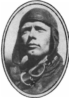
Lone Eagle Lindbergh