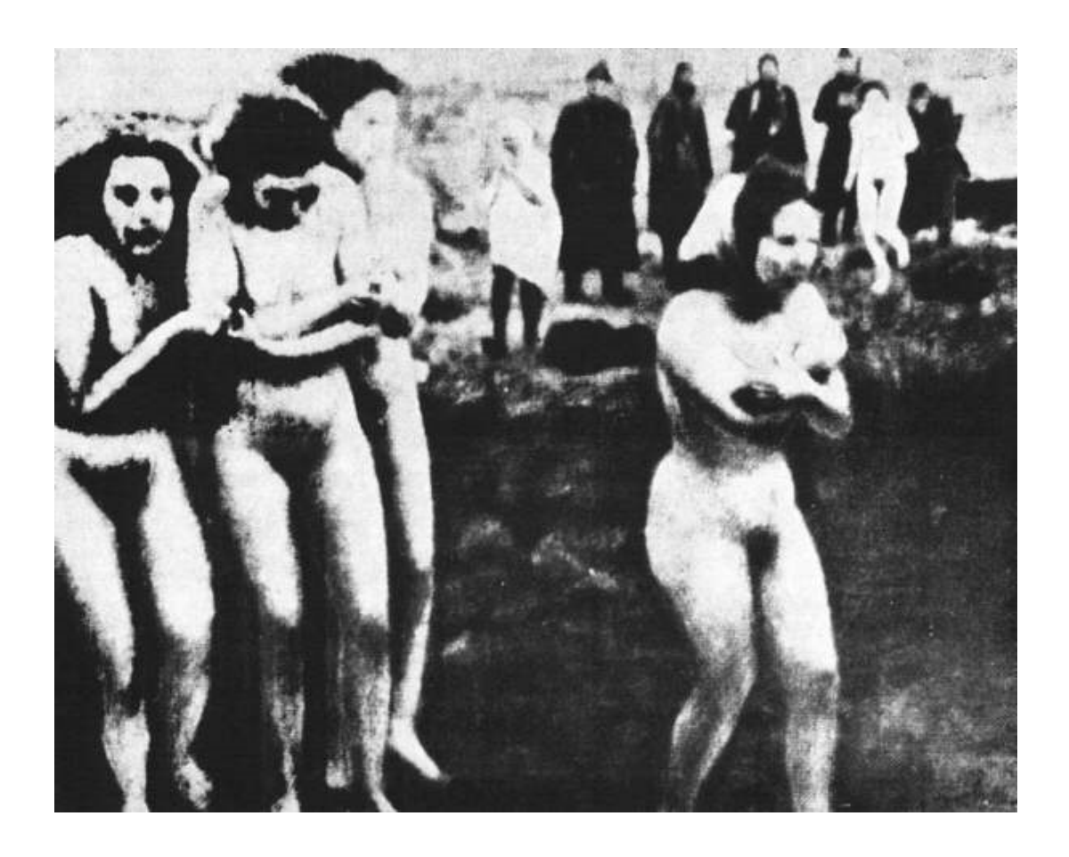
"On way to execution"

This painting, released as a "documentary photograph" was, according to our knowledge, "introduced into science" in 1960 and soon thereafter "improved upon"