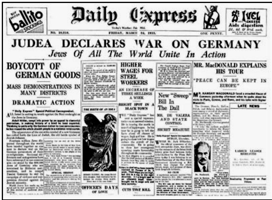
Daily Express headline, March 24, 1933.

the U.S. to intervene on behalf of Britain in World War 1. But, there was little impetus for Jews living in the comfort and security of Europe to populate and cultivate the wastes of Palestine. Therefore, it was the Zionists who again sought to apply pressure in this direction – this time aimed at Germany. This time, the only practical way out was to concede to Zionist wishes again, using whatever means necessary to expel most of the Jewish population under German control. Nazi Germany responded to send them trained in industry, military arts, and agriculture... funded and equipped, to a land which for the most part neither they nor their ancestors had ever seen.