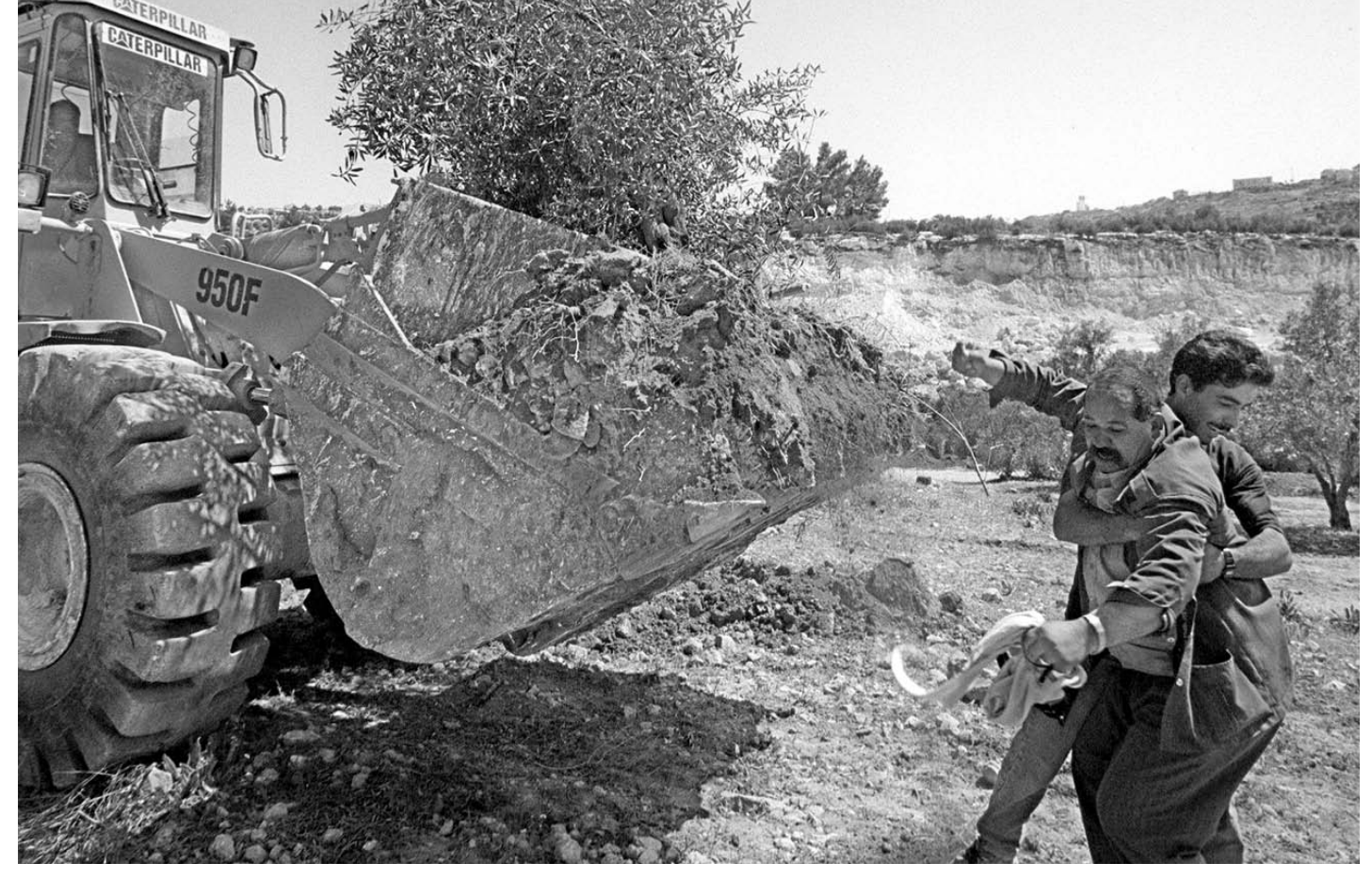
Some 15,000 olive trees were destroyed in the West Bank and Gaza Strip between the start of the current Palestinian uprising on September 28, 2000 to December 8 of 2000 alone, says a Palestinian human rights group. Israeli forces cite security reasons. But Arabs say that olive trees are more than mere hiding places for snipers. Their destruction is an economic and symbolic attack that is profoundly disheartening to Palestinians. In a recent such incident, an Israeli bulldozer tears down the olive trees of Palestinian farmer Abdul Aziz Khuteneh on March 20, 2001, to make a new road for Jewish "settlers" just outside the West Bank town of Hebron. Khuteneh is seen being dragged away by an Israeli soldier who appears to be laughing. He collapsed after the incident and had to be hospitalized.