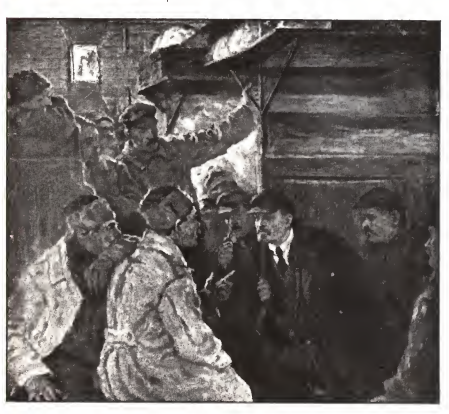
The Germans gave Lenin and party a sealed railway car . . .

On April 3rd, just 23 days after the provisional government had been formed, Lenin and his party arrived in Petersberg. Within 7 months he and his faction would be the supreme dictators of all Russia.