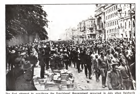
The first attempt to overthrow the Provisional Government occurred in July when Bolshevik mobs (above) staged bloody street demonstrations. This "July Days" revolt ended when Kerentky dispersed the mob with rifle fire and arrested, or drove into hiding, the Bolshevik leadership.

Government under the premiership of Prince Lvov. On July 20th, Kerensky (Adler) the Jewish Napoleon. became Prime Minister of a "salvation of the revolution" government. Kerensky was quite an orator, and he applied himself to the task of whipping up enthusiasm for an offensive against the Germans. Although he met with moderate success at first, the offensive failed and Kerensky's influence declined steadily in the next three months.