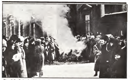
One of the first acts of the mob after storming the police stations was to burn police archives. Later the few policemen allowing themselves to be captrend were shot. With the mob in control, life in Petersberg became choolic. Servants refused to work, shops closed, workmen demanded fantatic wages. It was dangerous for a well dressed man to appear in public.