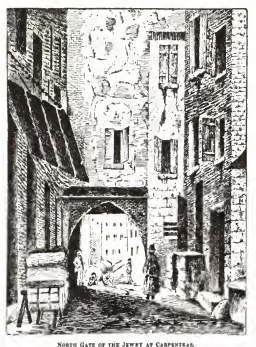
North Gatt of the Juwat at Cappentas. One the Provide Databach? In France, as in other countries, the Jews established their parasitic ghetto-communities. The one in Carpentas dates from the middle ages.

For ten centuries preceding the great evictions, in virtually every Christian nation of Europe (and in Mohammedan Spain, Africa, and Asia Minor) these Jews settled into these parasitic ghetto-communities and here they nurtured and maintained a culture which was quite a thing