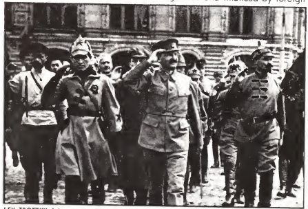
LEY TROTZKY (above center) is shown at the height of his power as Commissar of War. It was Trotzky who organized the Red Army and led it to victory over the White Russian Armies

Meanwhile the enemies of the new regime were gathering strength. Before the year was over the Soviet Government was under attack on six war fronts. Some of these anti-communist armies were organized by pro-Tsarist sympathizers; others were organized and financed by foreign