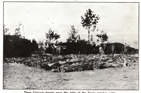
These Cossack troops were the elite of the Tsar's regular army.

were falling at twice the rate of the men." Altogether 18 million men were called to the colors, most of whom were conscripted from the peasantry. Although courageous in battle they proved politically unreliable and were easily incited by agitators.