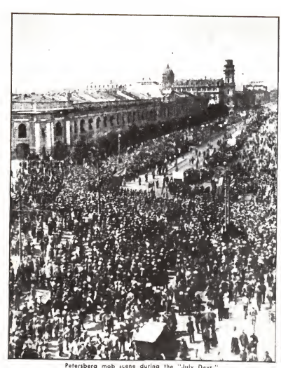
ob scene during the "July Days.

months away. This Sixth Congress was completely a Bolshevik affair. The other factions merged with the Bolsheviks and ceased to exist; from this time on the Russian Social Democratic Labor Party WAS the Bolshevik Party. (Within a year the party officially changed its name to the Communist Party)