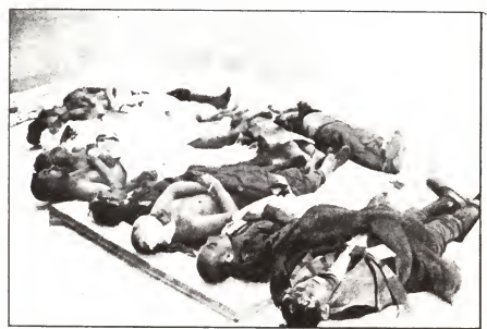
Wherever communists have come to power, their first act has been to execute or imprison the nation's leader class. Their second act is to install Jews in every position of power and authority. In Russia literally millions of gentiles were butchered by Jew executioners.

the blood of human beings would be ozing from under the doors of communist execution chambers as tens of thousands of Christian men and women were butchered like cattle in a slaughterhouse. Soon five million landowners would be deliberately starved to death as part of a premeditated plan. Soon a move would be under way to exterminate the gentile leader class of the entire nation by murdaring every Christian factory owner, and lawyer, and government leader, and army officer, and every other person who had been, or might be, a potential leader. Soon the standing population of the slave-labor camps would exceed 15 million. Soon every church and cathedral would be gutted, and every priest and preacher would become a criminal in his own community. Soon Russia would have a zombie-profetariat, docile, willing to work, easily controlled, incapable of revolt . . . Such was the "romance" of the Bolshevik revolution.