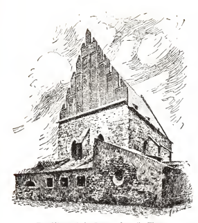
The Altneuschule, Prague, from the West, This medieval Jewish ruin dates from the 11th century. In the ghettos the Jews evolved their own language (Yiddish), and preserved a separate nationality.

As a point of fact these ahetto-communities existed only because the Jews wanted them to exist — they represented a desire on the part of Jewry to remain aloof and exclusive of Christian Society, Says Valentine's Jewish Encyclopedia: "There were as a rule officially recognized authorities in the Jewish