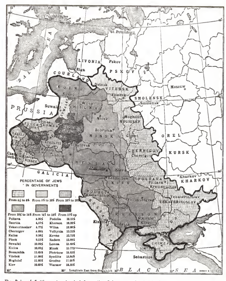
The Pale of Settlement extended from the Crimea to the Baltic Sea, encompassing an area half as great as western Europe. By 1917, seven million Jews resided there, comprising perhaps half the world's total Jewish population. It was within the Pale of Settlement that the twin philosophies of Communism and Zionism flourished. Both movements grew out of Jewish hatred of Christian civilization (persecutor of the "chosen race"), and both movements have spread wherever Jews have emigrated. The Pale of Settlement has been the reservoir from 14