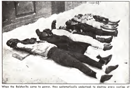
When the Bolshevikk came to power, they systematically undertook to destroy every vestige of opposition by exterminating the upper closses of Russlan society. The fury of the Red Terror can be explained only as a manifestation of Jewish hatred against Christian civilization. 'Russian Bolshevik Revolution ([Ibid page 45]) page 87), page 87.

Soon these hordes of returning Jews would exercise the power of life and death over 150 million Christian Russians. Soon every factory, every government bureau, every school district, and every army unit would function under the gimlet eye of a Jewish Commissar. Soon