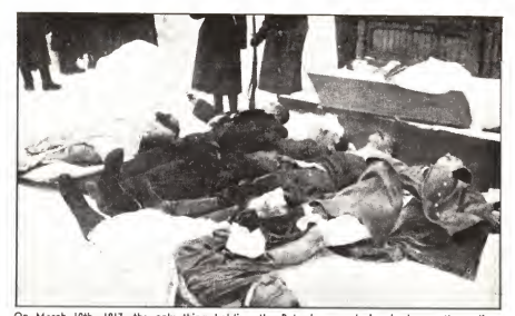
On March 10th, 1917, the only thing holding the Petersberg mob in check was the police. The decisive moment of the revolution came when armed mobs stormed the police stations, killing the police and freeing large numbers of corvicts, many of whom were the worst type of criminals.