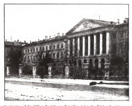
Headquarters of the Military Revolutionary Committee during the October Revolution was Smolny Institute. From here Trotsky commanded the forces which overthrew the Kerensky regime.