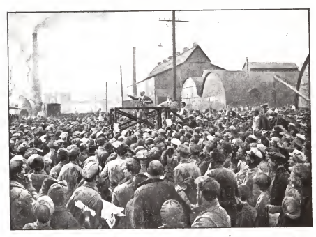
Immediately upon their arrival in Patershero, the Bolshevils, headed by Lesin (shown above addessing heatony workers) began egistants against the Provisional Government. The Bolshevik slogan was "All Power to the Soviets." Eventually the Bolshevils were able to vin over the more radical elements of Petersberg's unatable industrial population.

Soviet was the Menshevik, Tcheidze, a "defensist" who strongly supported the war effort. Of the two vice-presidents, one was Skobelev, also a Menshevik, and the other was Kerensky, the only member of the 12 man Provisional Government who also belonged to the Soviet.