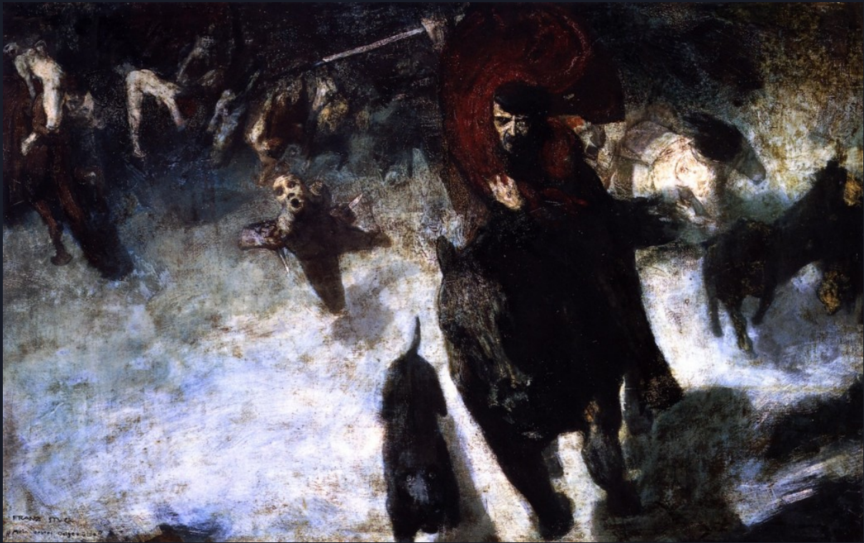
Wotan leading 'The Wild Hunt' – 1899AD – Franz von Stuck