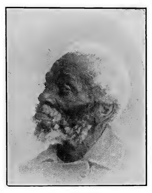
"OLD UNCLE WASH."