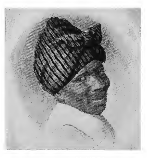
"OLE BLACK MAMMY."