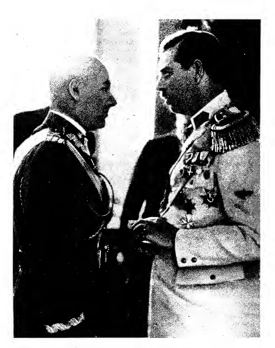
KING CAROL OF ROMANIA.