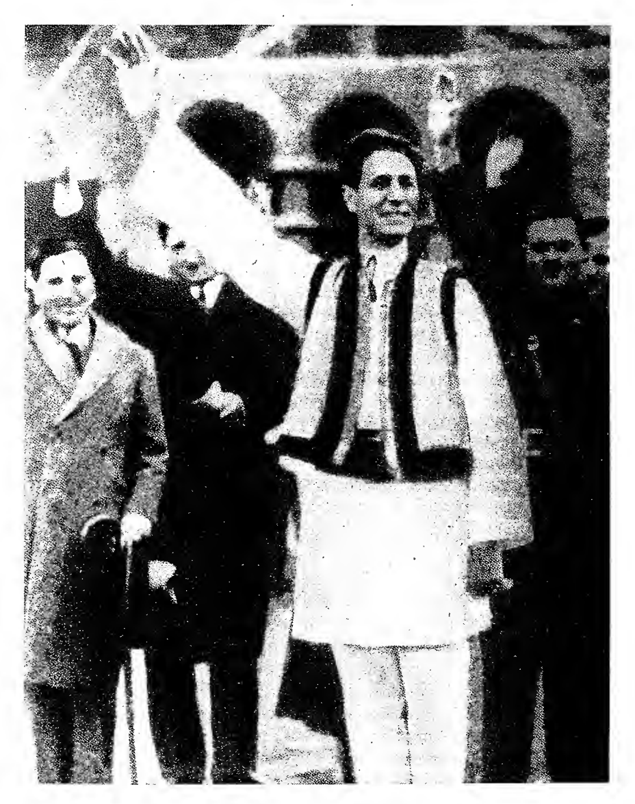
TAKING THE SALUTE.