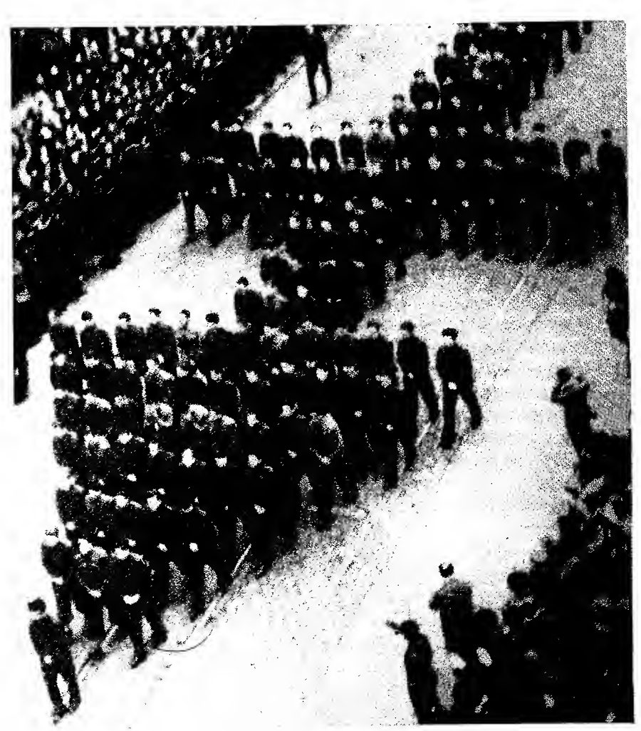
The Legionary "Living Cross" leads the huge parade that buries the body of Codreanu in the Green House in Bucharest in 1940.